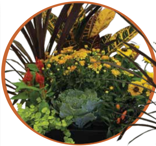
Planter Back View