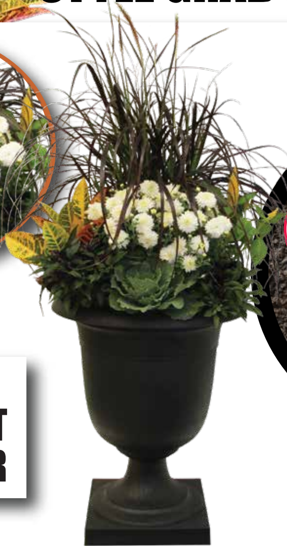
Planter Back View